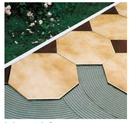
Laying on exterior floor