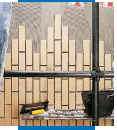
Exterior wall fixing