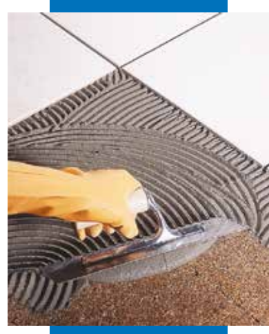
Installation of single-fired tiles on cork