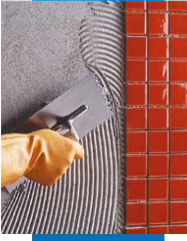
Installation of mosaic ceramic on wall