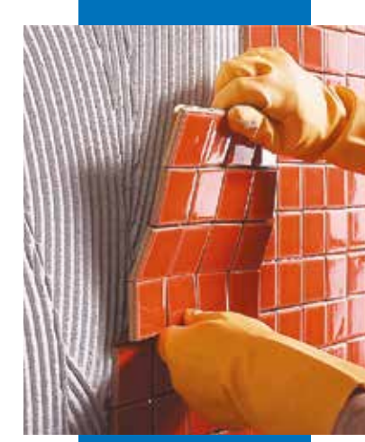
Installation of mosaic ceramic on wall