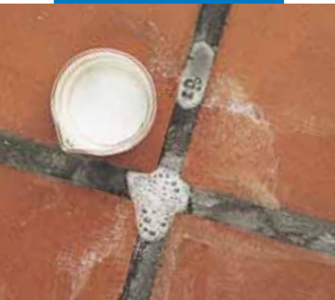
Cleaning an efflorescence