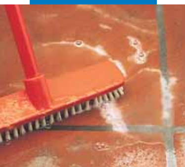
Cleaning with Keranet liquid by polishing brush