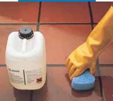
Cleaning with Keranet liquid