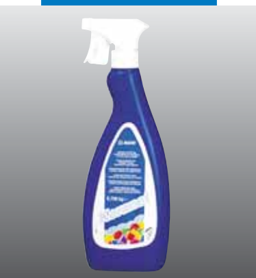
Keranet liquid is available both in drums and in bottles with nebulizer